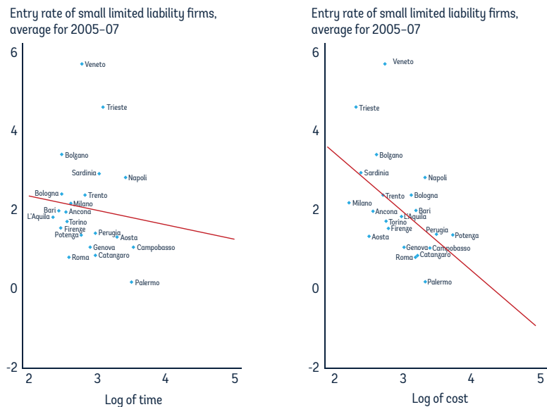
FIGURE 13.1 Bureaucratic time delays and costs are associated with lower entry by small limited liability firms across Italian provinces

Note: Entry rate is the ratio of the number of newly registered small limited liability firms to the total number of limited liability firms.